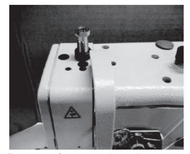
Pressure force can be adjusted simply and certainly with thumb screw at top.